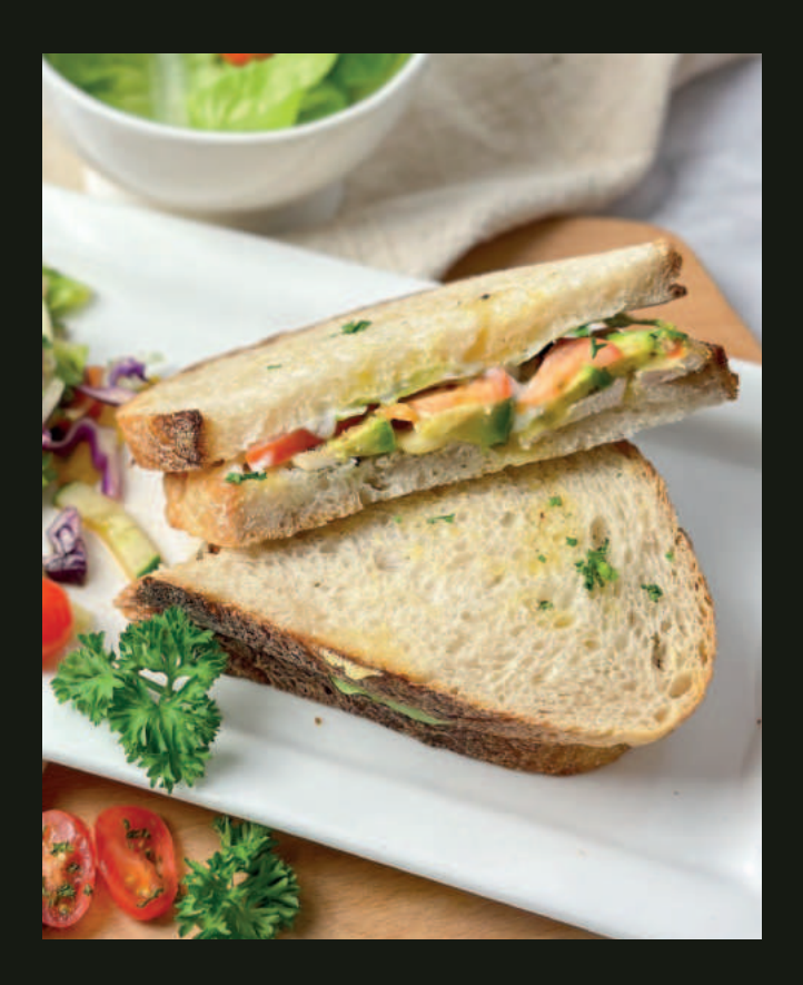
Chicken Avocado Sandwich 23.0 Healthy grilled chicken layered with vegetables & cheese